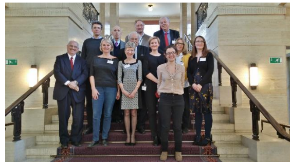
Meeting of Academia Europaea Hub representatives, University of London

Representatives from all four Academia Europaea Hubs, together with the Young Academy of Europe, gathered in London in March to exchange progress reports and to coordinate planning in areas such as website development, marketing and communications.