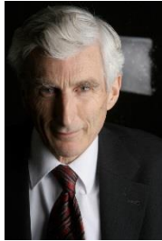
The Erasmus Lecture, given by the UK's Astronomer Royal, Lord Rees of Ludlow (left)