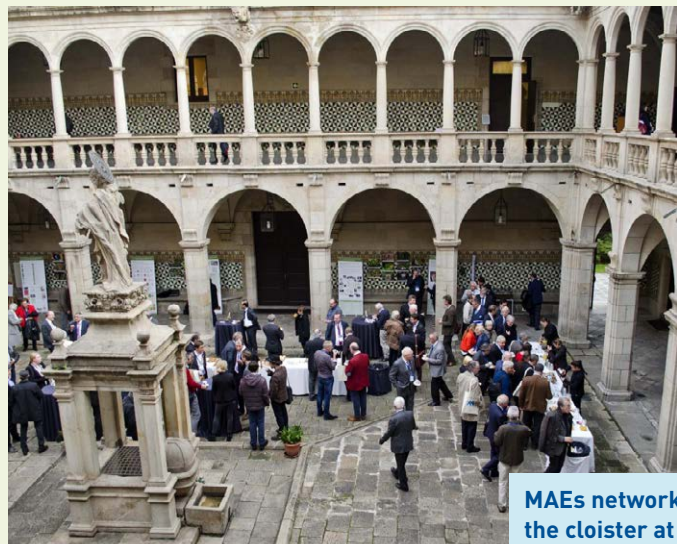
MAEs networking in the cloister at the IEC