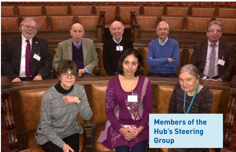
Members of the Hub's Steering Group