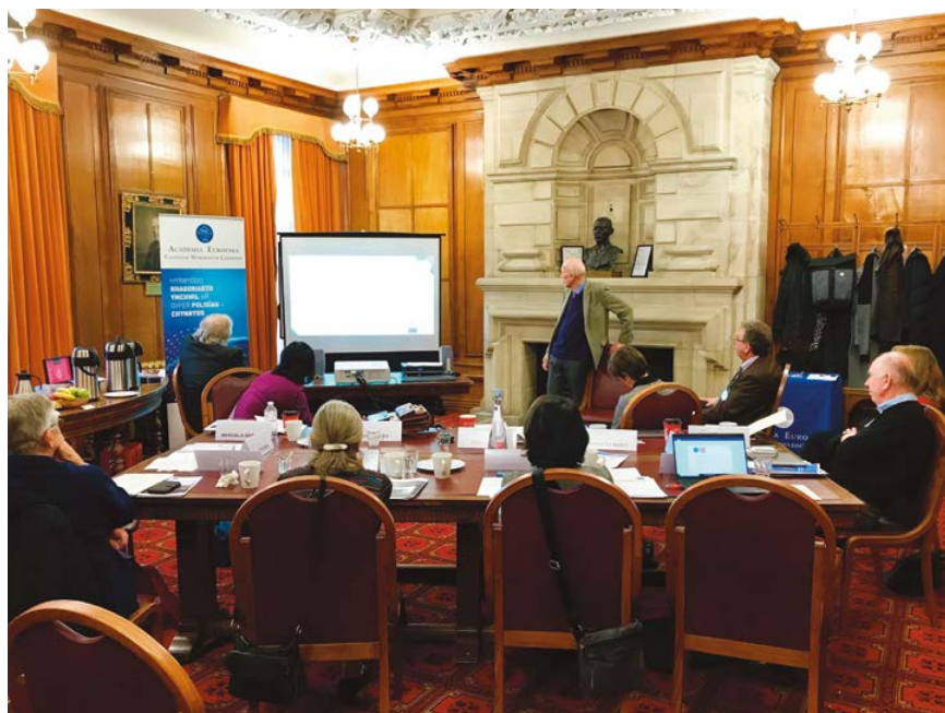
AE Cardiff Steering Group meeting, Cardiff University, January