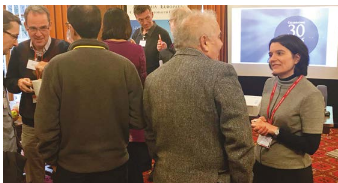
Guests mingle at the 30th anniversary event held at Cardiff University, January