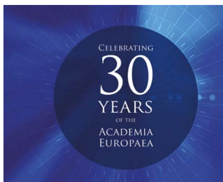
Front cover of the AE's 30th anniversary brochure

Continuing the Academia Europaea's 30th anniversary celebrations, the Cardiff Hub held its own festivities in January. Members of the Academia Europaea, along with colleagues who have generously supported the Cardiff Hub's work, gathered at Cardiff University's Glamorgan Building to mark the Academia's anniversary. Following a drinks reception and networking session, there was a lively debate on Plan S, the initiative for Open Access academic publishing.