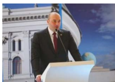
Prime Minister of Georgia, Mamuka Bakhtadze, at the launch of the AE Tbilisi Hub, April