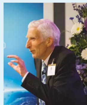
Lord Martin Rees MAE

Director of the AE Tbilisi Hub and Professor at the Pasteur Institute in Paris