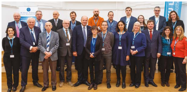
Panellists and organisers of The Future of Research: Assessing the Impact of Plan S

In November, the Cardiff Hub held its first ever major event overseas, The Future of Research: Assessing the Impact of Plan S , at KU Leuven. A distinguished panel of experts debated the prospects for researchers, universities, learned societies and academies, with an audience of 130. The conference included a welcome reception at the historic University Library. The event was a collaboration between the Academia Europaea Cardiff Knowledge Hub, the Young Academy of Europe, KU Leuven Libraries and Cardiff University. A post-event report will be released early in 2020.