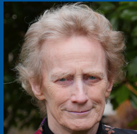
Dame Athene Donald MAE