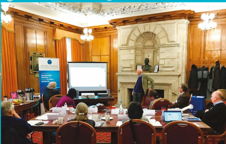
The Cardiff Hub's international steering group, Cardiff, January 2019

Academia Europaea Knowledge Hub Wales Cardiff University CUBRIC Maindy Road Cathays Cardiff CF24 4HQ United Kingdom www.aecardiffknowledgehub.wales AECardiffHub@cardiff.ac.uk Tel: +44 (0)29 2068 8249