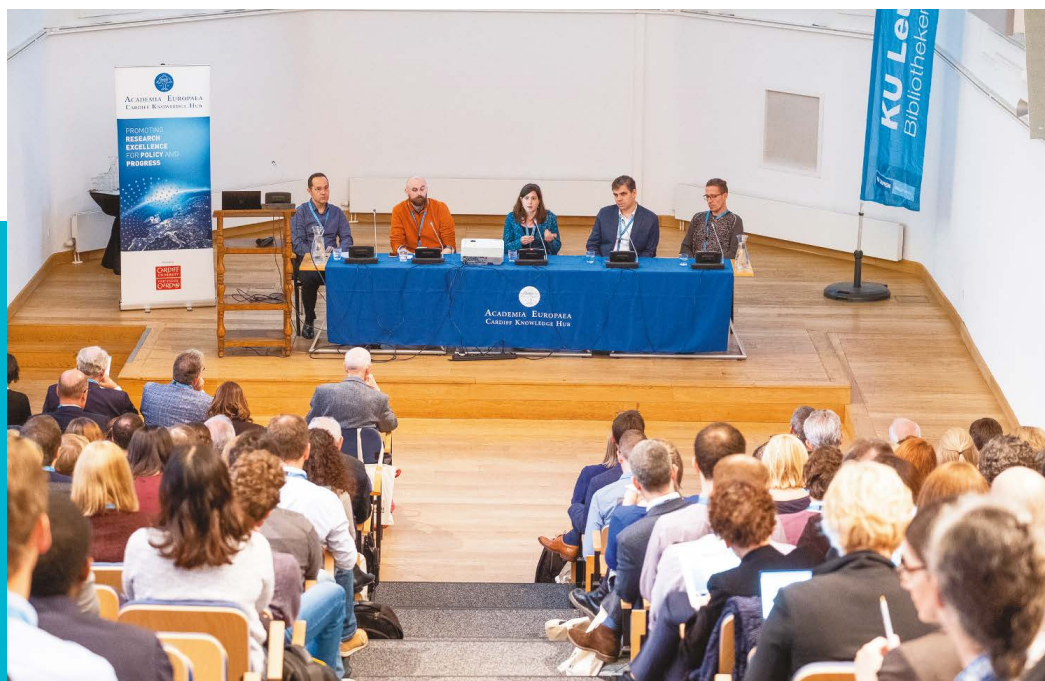
The Cardiff Hub organised an international symposium at KU Leuven in November 2019

Amount of externally-sourced income raised annually.