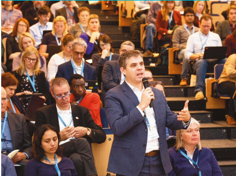
Our international symposium on Plan S, Leuven, November 2019

The Cardiff Knowledge Hub will promote these values throughout our work.